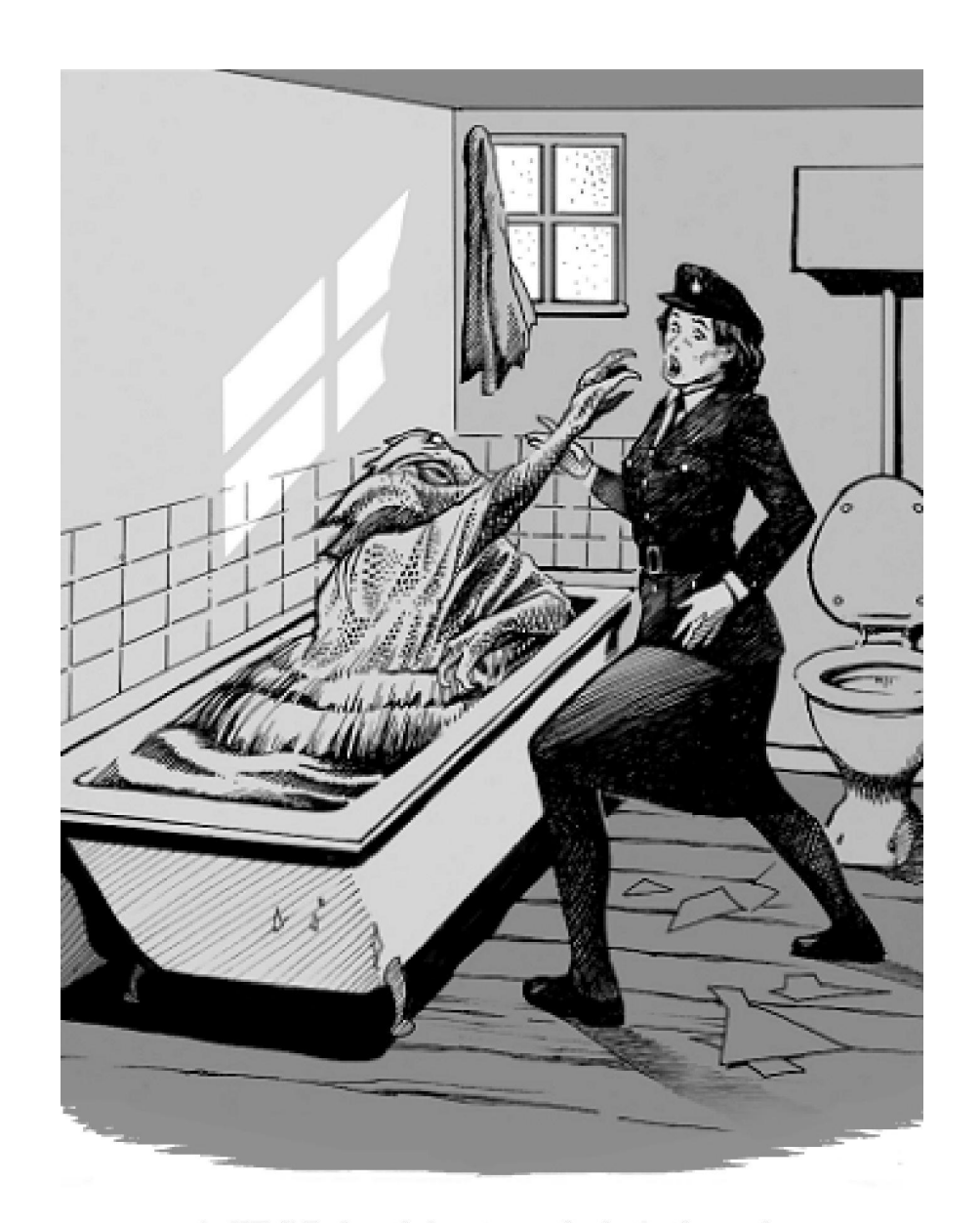
As WPC Redworth leant over the bath, the surface erupted into a fountain of dirty water, scum and slime. She couldn't scream, her mind wouldn't let her.

Must get away, run for my life. The Devilbacks, yelling and hissing. Spitting. I have to protect the family - even if they catch me the family must be saved. I won't let them touch me. . . won't let them trick me into leading them to the others. Those eyes, staring from every angle, every tree and bush. Every path. I'm being watched. The Devilbacks think they'll trick me,